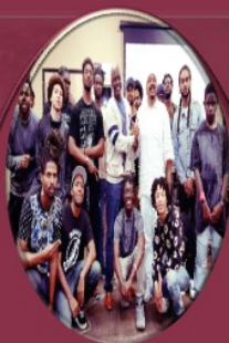
CARES Mentoring's sessions and wellness circles