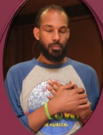
A Touch Of Life's wellness workshops for MDP teachers