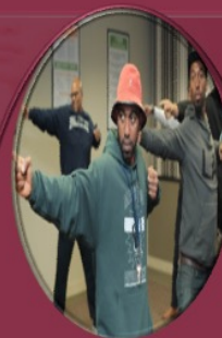
Oakland community events such as Radiant Health Strategies' wellness sessions during the OUSD Fall Forums, Spring Symposiums, and teacher trainings, etc.

“The Black Teacher Leadership and Sustainability Institute is the Black Teacher Project’s signature professional development offering – an experiential institute providing ample opportunities for Black teachers to share, reflect and set intentions for how to lead from the classroom. Teachers will deepen their commitment, relationships and agency while developing strategies for leadership and sustainability” (Programs, 2016, https://www.blackteacherproject.org/btp-programs ).