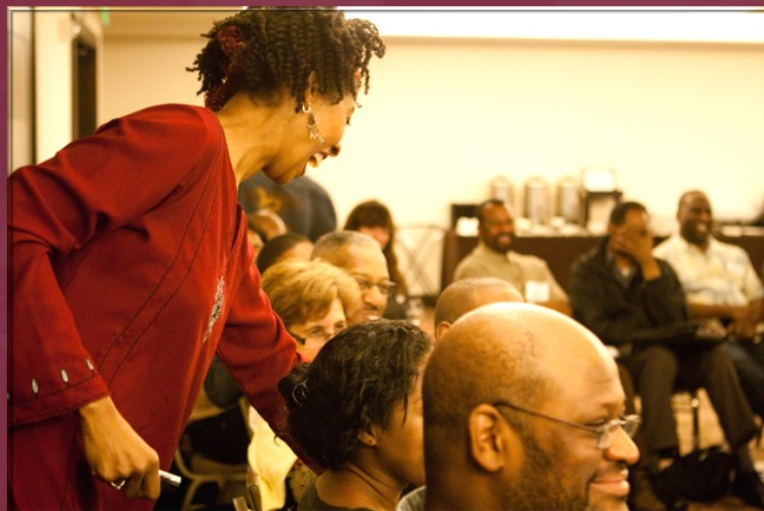
The Campaign for Black Male Achievement's Transformational Leadership retreat in 2009.