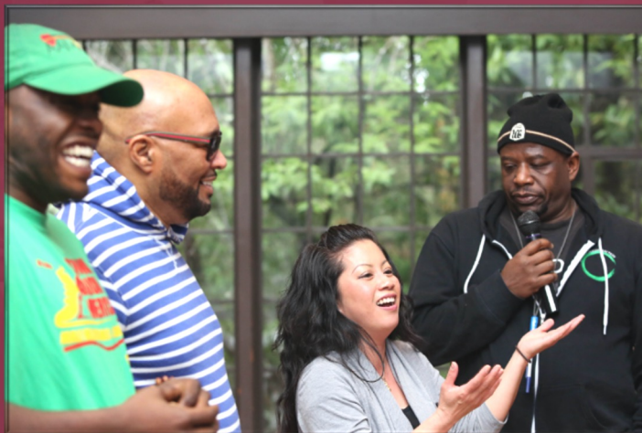
Figure 1 illustrates the effective use of icebreaker activities as a culturally responsive strategy for promoting engaging dialogue between participants.

A Community-Based Ecosystems Approach: Icebreaker Activities To Cultivate Joy, Trust And Collaboration