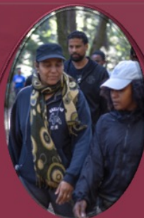
Spearitwurx's Powerful Parenting workshops